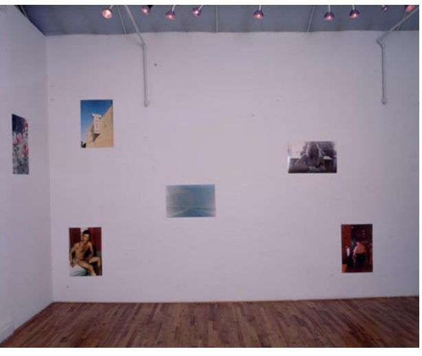
Fig. 1 Jack Pierson installation view, Simon Watson Gallery, New York, 1990.

narrative. Pierson's own unorthodox hanging style reflected a graphic-design sensibility, where the space of the exhibition could be seen as an extension and activation of the space of the page: distributing images across the field, using the corner and edge, and so forth.