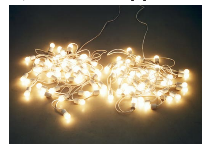
Fig. 7 Felix Gonzalez-Torres, Untitled (Lovers-Paris), 1993 15-watt light bulbs, porcelain light sockets, and extension cords: Overall dimensions variable; two parts, each 61 feet (18.59 meters) long

conceptual investigations always had a slightly more narrative feel than the more deadpan work of Douglas Huebler. This history gave Pierson the freedom to use any materials or media-photo, drawing, text, performance, painting, objects-in the service of art, as did the low-budget ethic of "available-ism" of East Village artists such as Kembra Pfahler, who were committed to making art with whatever they had, as opposed to the slick, presentation-driven aesthetic that dominated the commercial art world by the 1980s. When he saw the performance photos of artists such as Joseph Beuys, Vito Acconci, and Chris Burden, Pierson remembers, he was struck by their romantic and intensely poetic qualities. Recalling the grainy black-and-white documentation of Burden crawling over glass, he retained the sense that "you could take a picture full-mindedly . . . without it being clear that is was documenting anything real. Did he do it or not? It was never clear."