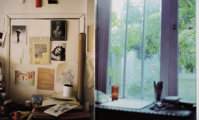
Fig. 3 Double-page spread from Jack Pierson: Angel Youth, published by Galerie Aurel Scheibler, Cologne, 1992

Cindy Sherman. While Prince's compilations were often read as analyses of aggression and sexuality in the media, they quickly revealed something more personal and emotionally driven: fragments of stereotypes and clichés that, for all their familiarity and overuse, still provoke longing and desire.<sup>2</sup> This territory links Pierson's project to Prince's, as does Pierson's use of full-page bleeds and willingness to treat his photographs as elements of a larger concept. Angel Youth assembles images into diptychs, with