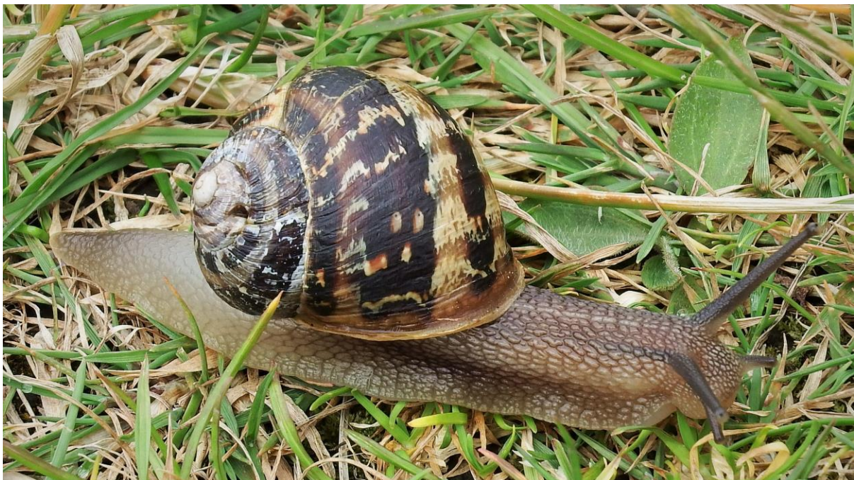
Figure 1. Cornu aspersum , the common garden snail. Photo: Bryony Pierce (cropped).

If you grew up in a temperate climate, you probably spent some time bothering brown garden snails ( Cornu aspersum , formerly known as Helix aspersa ; Figure 1) or some closely related species of pulmonate (air-breathing) gastropod.