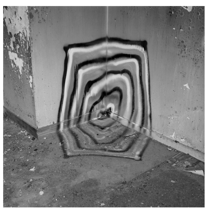
Fig. 17. John Divola, Vandalism (1973–75) photograph 20 \times 16 on gelatin silver paper.

little wives feel the edge of the carving knife and study their husbands' necks')<sup>52</sup> the fire, in Didion's account, was so catastrophic that 'horses caught fire and were shot on the beach, birds exploded in the air. Houses did not explode but imploded, as in a nuclear strike'.<sup>53</sup> By the time the fire had terminated at the water's edge, 197 houses had vanished into ash.<sup>54</sup> It is the particular incendiary image of urban form and fire, to quote the words of Didion, that serves as 'Los Angeles' deepest image of itself'.<sup>55</sup> Written in the midst and aftermath of the Watts riots, Didion remembers viewing Los Angeles from the city's Harbour Freeway, looking down on a metropolis engulfed in flames and covered in smoke. 'Los Angeles weather', Didion was inclined to claim, 'is the weather of catastrophe, of apocalypse'.<sup>56</sup>