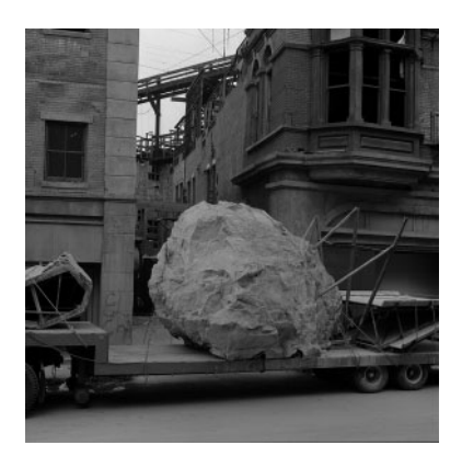
Fig. 6. John Divola, MGM Lot (1979–80) photograph 16 \times 20 on gelatin silver paper, courtesy of the artist.