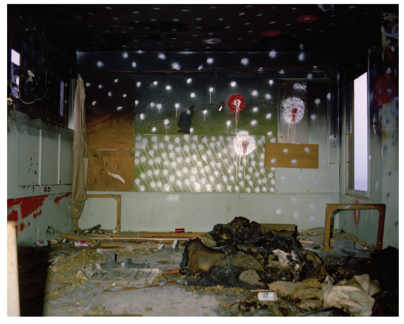
Fig. 18. John Divola, Zuma (1977–78) photograph 24 \times 30 on rag paper, courtesy of the artist.

57. Thomas Crow, 'The Art of the Fugitive in 1970s Los Angeles: Runaway Self-Consciousness', in Under The Big Black Sun (Los Angeles: The Museum of Contemporary Art, Los Angeles, 2011), p. 46.