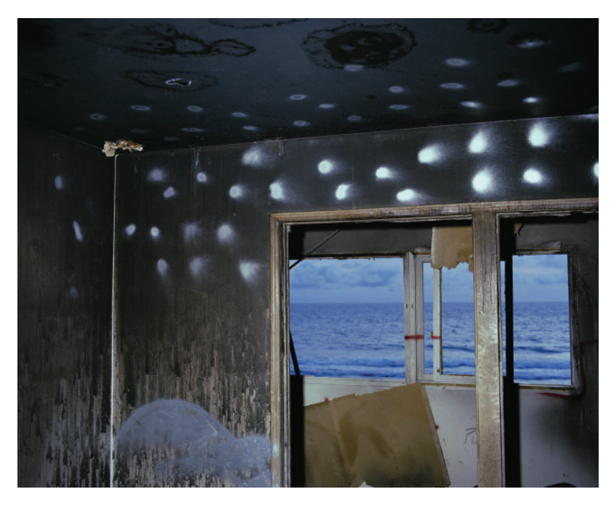
Fig. 3. John Divola, Zuma (1977–78) photograph 24 \times 30 on rag paper, courtesy of the artist.