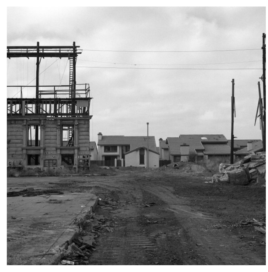
Fig. 7. John Divola, MGM Lot (1979–80) photograph 16 \times 20 on gelatin silver paper, courtesy of the artist.

obsolete accumulation of images, objects, and facades that a corporation merely demolishes and casts away. These dream-images of the city appear to materialise, but just as quickly also appear to crumble and disappear.