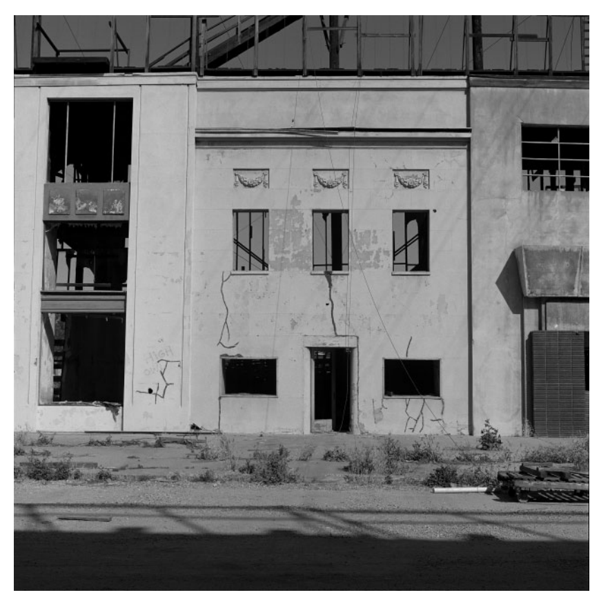
Fig. 8. John Divola, MGM Lot (1979-80) photograph 16× 20 on gelatin silver paper, courtesy of the artist.

of a near-future Los Angeles in the film Blade Runner (1982), a film that retrofitted Burbank Studios' 'Old New York Street', used previously for the noirs The Big Sleep and The Maltese Falcon.