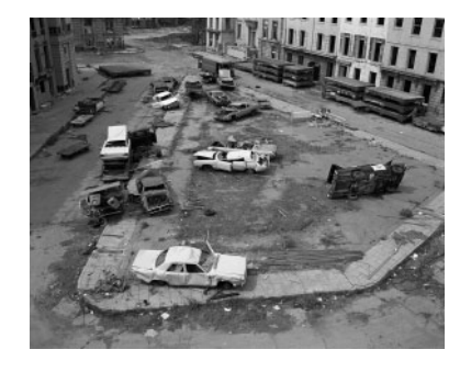
Fig. 5. John Divola, MGM Lot (1979–80) photograph 16 \times 20 on gelatin silver paper.

Despite some obvious similarities between Rosler and Divola, the comparison between the two photographers is perhaps unhelpful. The two terrains are obviously cut from a different piece of cloth, or cardboard, so to speak (Fig. 8). Divola's 'ruin' speaks not only of the just-past of 'New York' but also the obsolete just-past of the MGM backlot. It is in this frame that Divola's image of the future reads as historically sedimented: a vestige of a crumbling world projected both backwards and forwards in time. The city is envisioned by the photographer as fiction: a ruin continuously made and unmade, built and destroyed, recurring again and again, as a farcical image. The urban fiction of Hollywood, in Divola's iteration, amounts to almost nothing except perhaps the