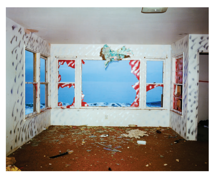
Fig. 4. John Divola, Zuma (1977–78) photograph 24 \times 30 on rag paper, courtesy of the artist.