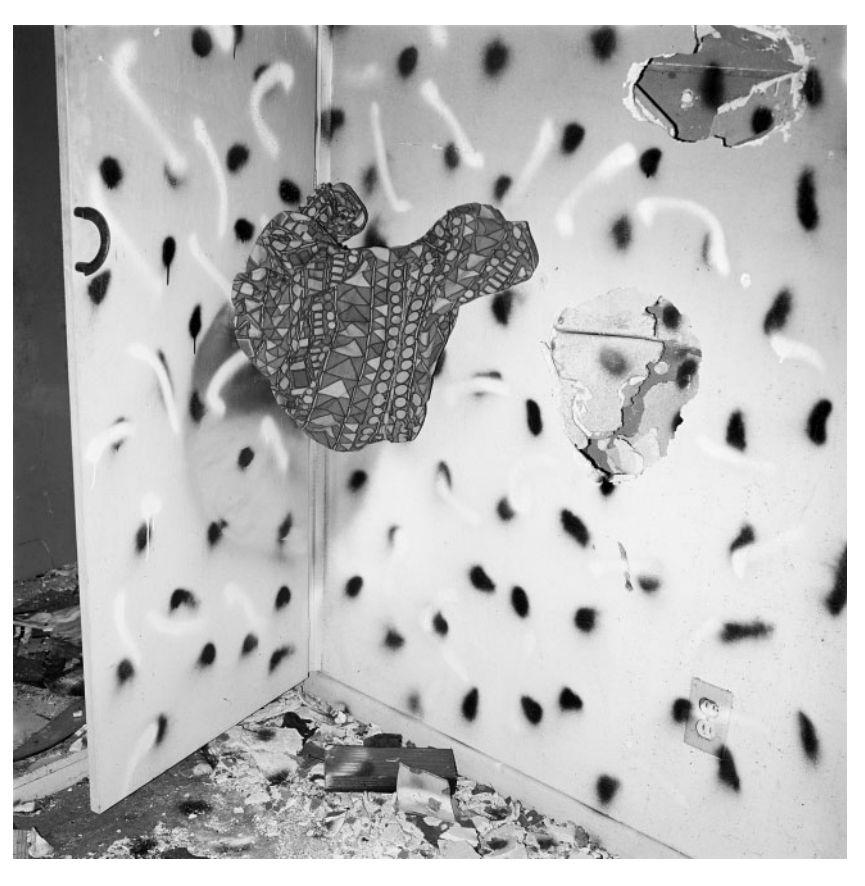
Fig. 15. John Divola, Vandalism (1973–75) photograph 20 \times 16 on gelatin silver paper, courtesy of the artist.

one scene in Vandalism reads in alternating overlaid script as if the mind were writing and rewriting, inscribing and re-inscribing the artist's encounter with the site: 'I'm here/It's there/I'm not here/It's not there'. The graphic mark is both the 'Here' and 'There' from which a particular (subjective) perspective is declared and received. Divola works with the dialectical play of writing and overwriting (photographing and re-photographing) the graphic site. Roland Barthes writes in Camera Lucida : 'Show your photographs to someone — he will immediately show you his: "Look, this is my brother; this is me as a child", and so forth; the photograph is never anything but an antiphon of "Look", "See", "Here it is"; it points a finger at certain vis-à-vis, and cannot escape this pure deictic language.' As Divola revisits the site, the artist is drawn to his own gesture and adds another to the sequence. So too is the viewer called to attend to the marks and in some way respond to their spatial and temporal specificity in each frame and then elaborate the 'will have been' of the photograph through which the sequence operates within.