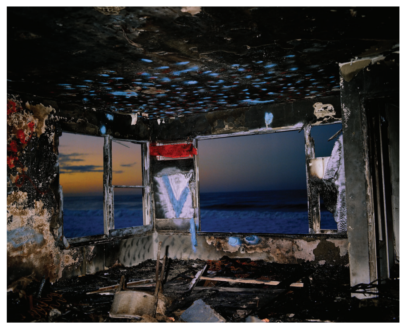
Fig. 19. John Divola, Zuma (1977–78) photograph 24 \times 30 on rag paper, courtesy of the artist.

forgetting, but that seems to slow time itself, an in-between state in which the last light of the day may still play out its ultimate marvels. It is memory's privileged time.' In Zuma , the shifting particulars of twilight are counterposed to the more concrete particulars of Malibu beach, which are counterposed to another extreme of Los Angeles: the desert (a central motif in Divola's MGM Lot and Divola's Vandalism series). These two extremes — the beach and the desert — I want to argue, function like the atmosphere of twilight: as two sites for speculative fiction, two sites dialectically related to one another. In the literature on Los Angeles, the beach and the desert are held as two speculative terrains of the region. In the region of the region.