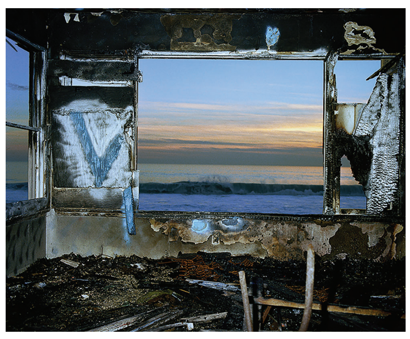
Fig. 2. John Divola, Zuma (1977–78) photograph 24 \times 30 on rag paper, courtesy of the artist.

and other scenes of social conflict. Surveying the wreckage, one can only speculate on the violence that has befallen the city: nuclear fall-out? plague? riot? machines out of control? It is altogether unclear what has caused this particular disaster.