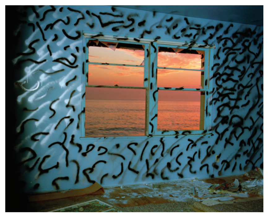
Fig. 1. John Divola, Zuma (1977–78) photograph 24 \times 30 on rag paper, courtesy of the artist.

3. These remarks on the photographic frame echo Rosalind E. Krauss's observations in the exhibition catalogue L'Amour Fou. See: Rosalind E. Krauss, 'Photography in the Service of Surrealism', in L'Amour Fou (New York: Abbeville Press Publishers, 1985), p. 35.