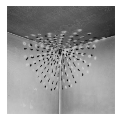
Fig. 10. John Divola, Vandalism (1973–75) photograph 20 \times 16 on gelatin silver paper, courtesy of the artist.

This strategy is the strongest in the series Forced Entries (1975–76). The work was part of a larger project, Los Angeles Airport Noise Abatement Zone (LAX NAZ) (1975–76), a series of photographs set within a condemned neighbourhood adjacent to Lost Angeles International Airport that had been expropriated by the city to serve as a noise buffer for a new runway. For a number of years in the early to mid-1970s, many houses were abandoned and stood vacant for a number of years. LAX NAZ comprised three sub-projects: Forced Entries (1975–76), forensically posed photographs of evidence of forced entries (Fig. 12); a series of photographs of interior and exterior scenes detailing the houses and the