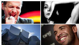
CHEAT SHEET: Fall Arts Preview