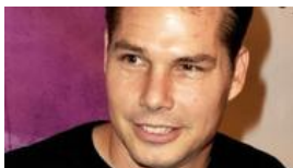
Shepard Fairey teams with MTV on new documentary series