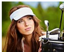
8 Myths About the Golf Swing Square to Square Method