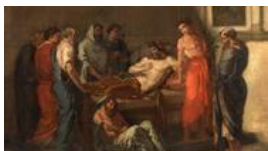
Painting thought to be by Delacroix discovered in Santa Barbara