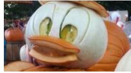
Photos: The carved pumpkins of Disneyland