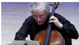
Review: A smoother sound from Juilliard String Quartet