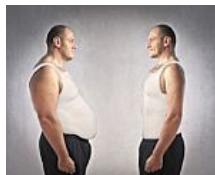
3 Ways Guys Can Drop 20lbs Quickly Hot Topix