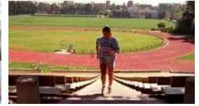
Photos: 13 great places to run in L.A.