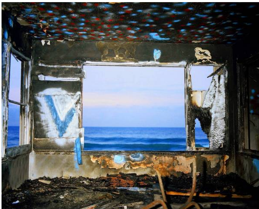
John Divola's Zuma No. 25, 1977; pigment print on rag paper. (1996-98 AccuSoft Inc. / Pomona College Museum of Art / May 23, 2013)

Comments 0 Email Share 36 Tweet 5 Like 31 0