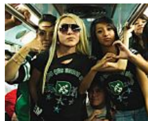
The Subway Gangs of Mexico City Vice Magazine