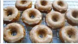
Jonathan Gold quiz: Doughnuts