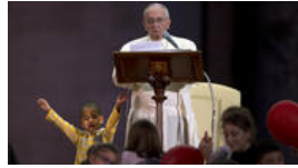
Photos: Boy wanders onto stage with Pope Francis