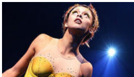
PHOTOS: Arts and culture in pictures