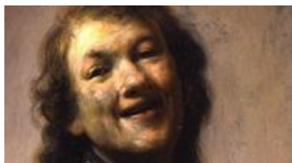
Rembrandt smiles on Getty Museum visitors and staff