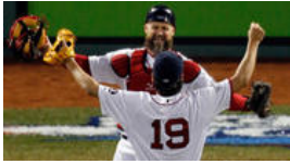
Photos: Cardinals-Red Sox, World Series Game 6