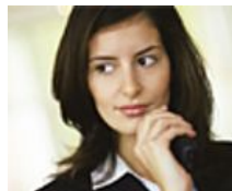
5 Questions That Will Not Get You Hired Monster