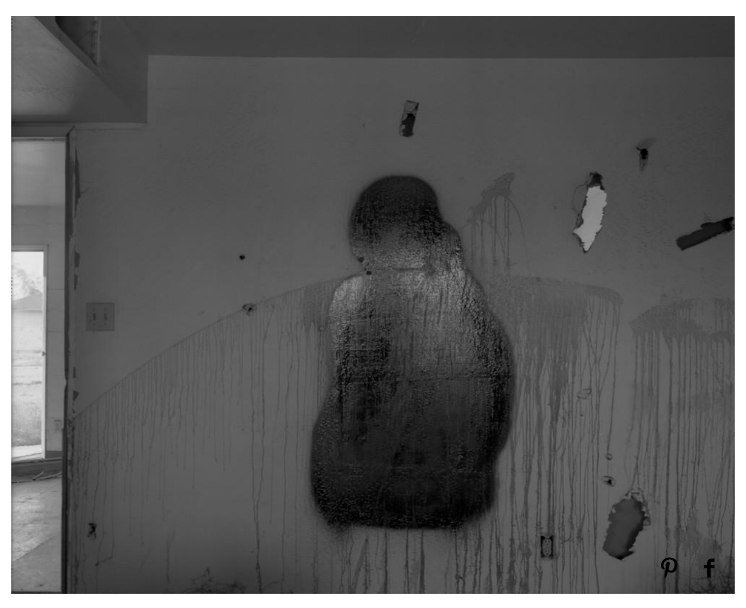
Work in Progress George Air Base, Untitled, 2016