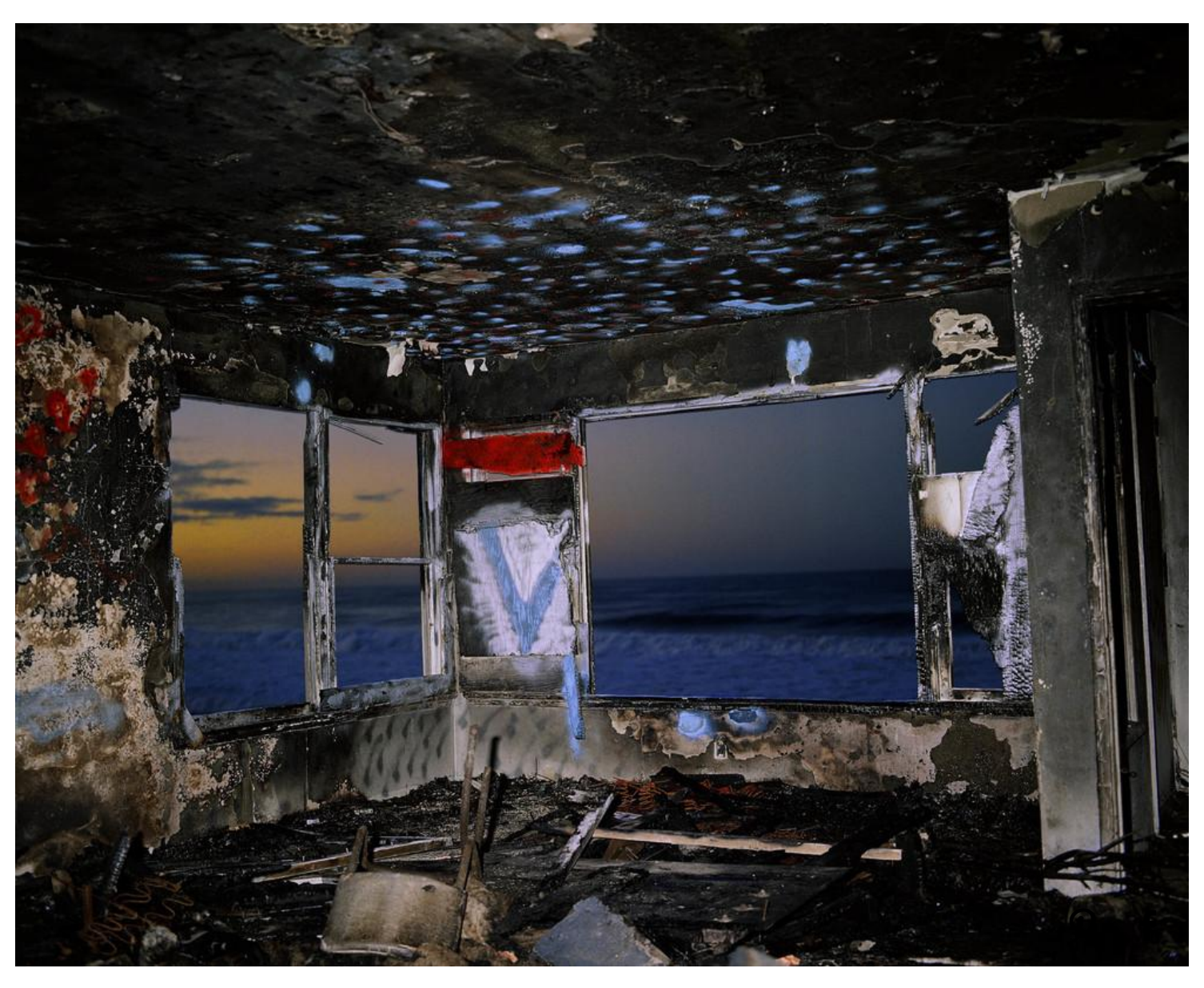
From Zuma Series, Zuma #04, 1978