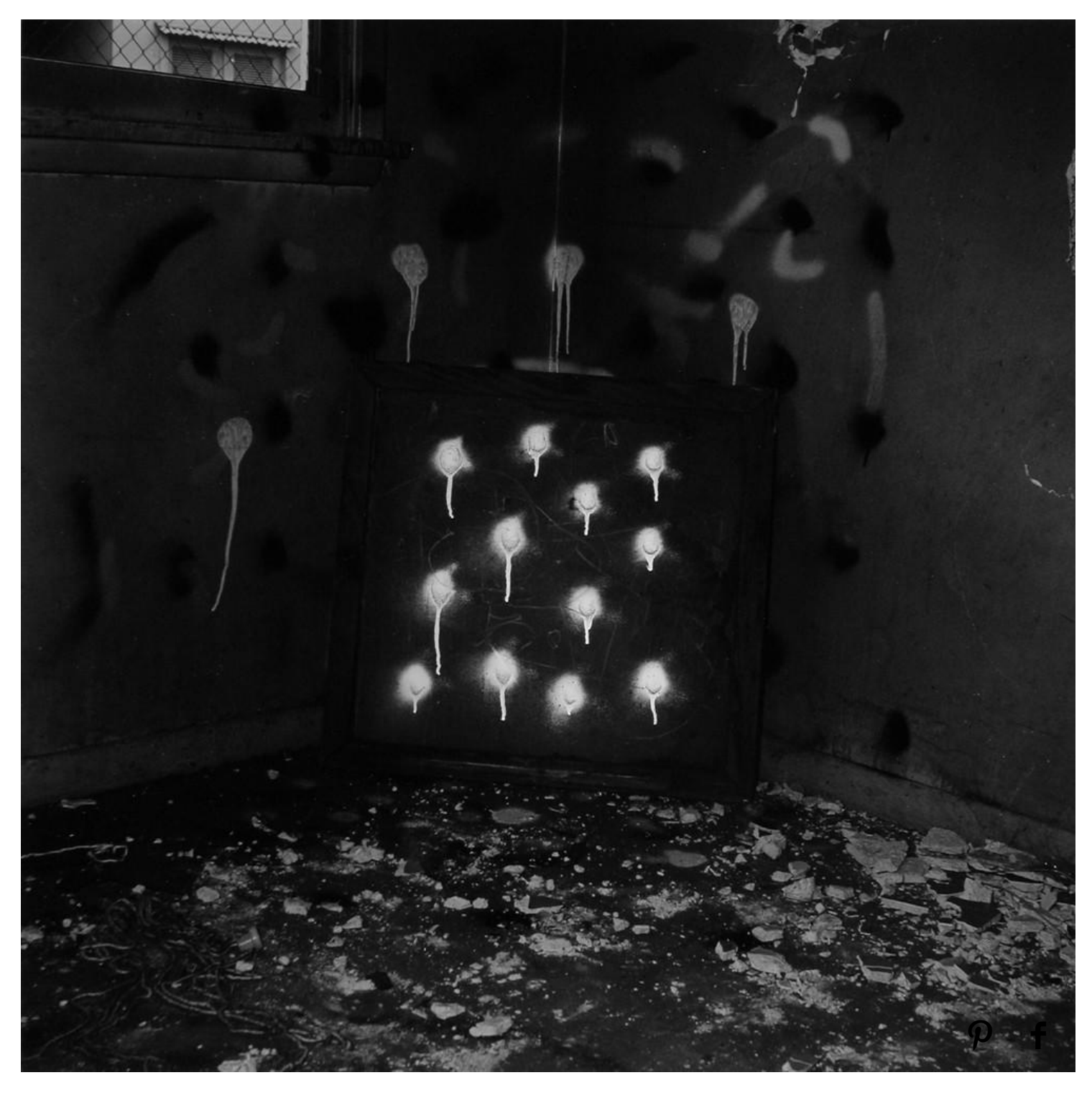
Form Vandalism Series, 74V34, 1974