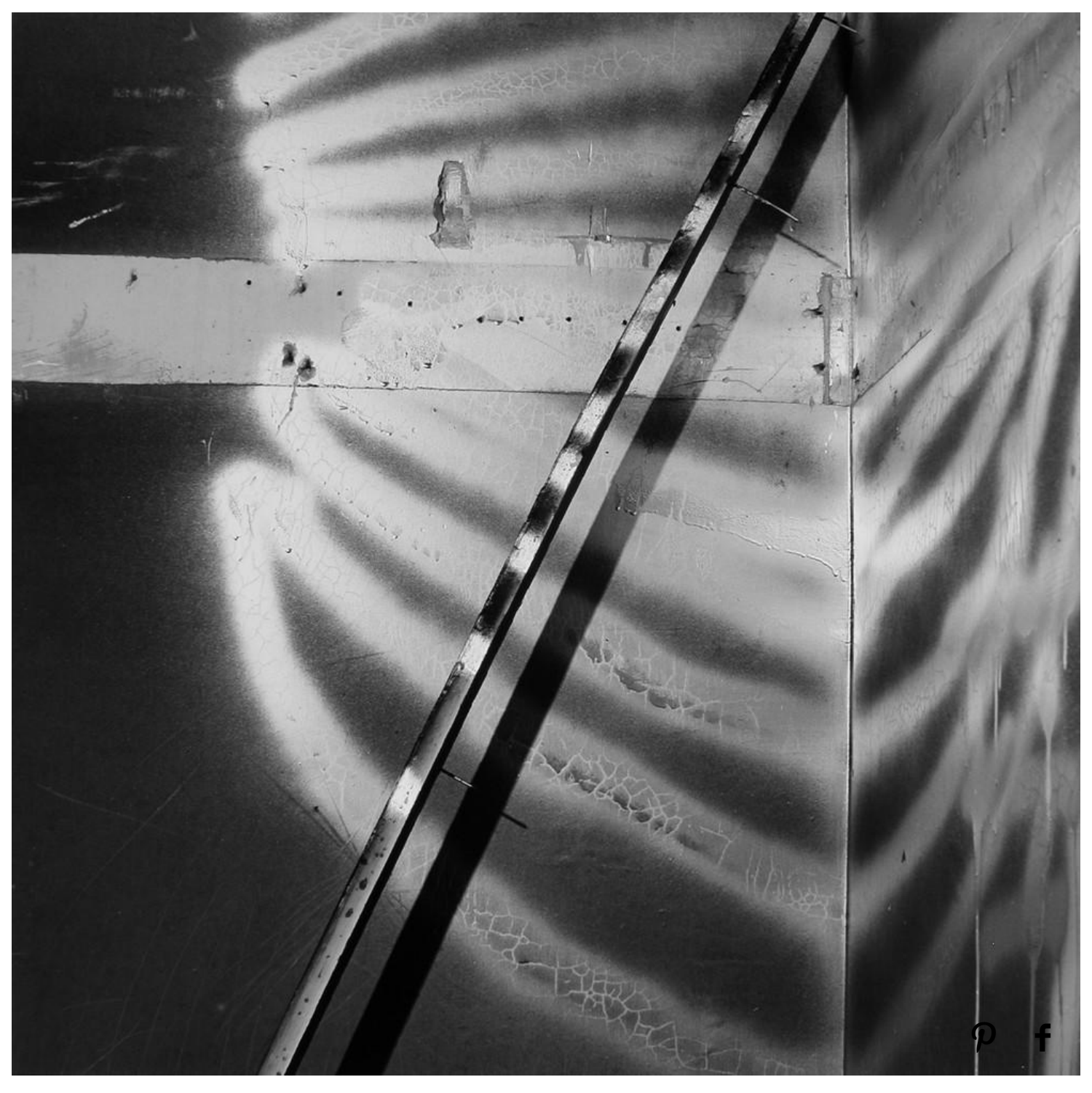
Form Vandalism Series, 74V03, 1974