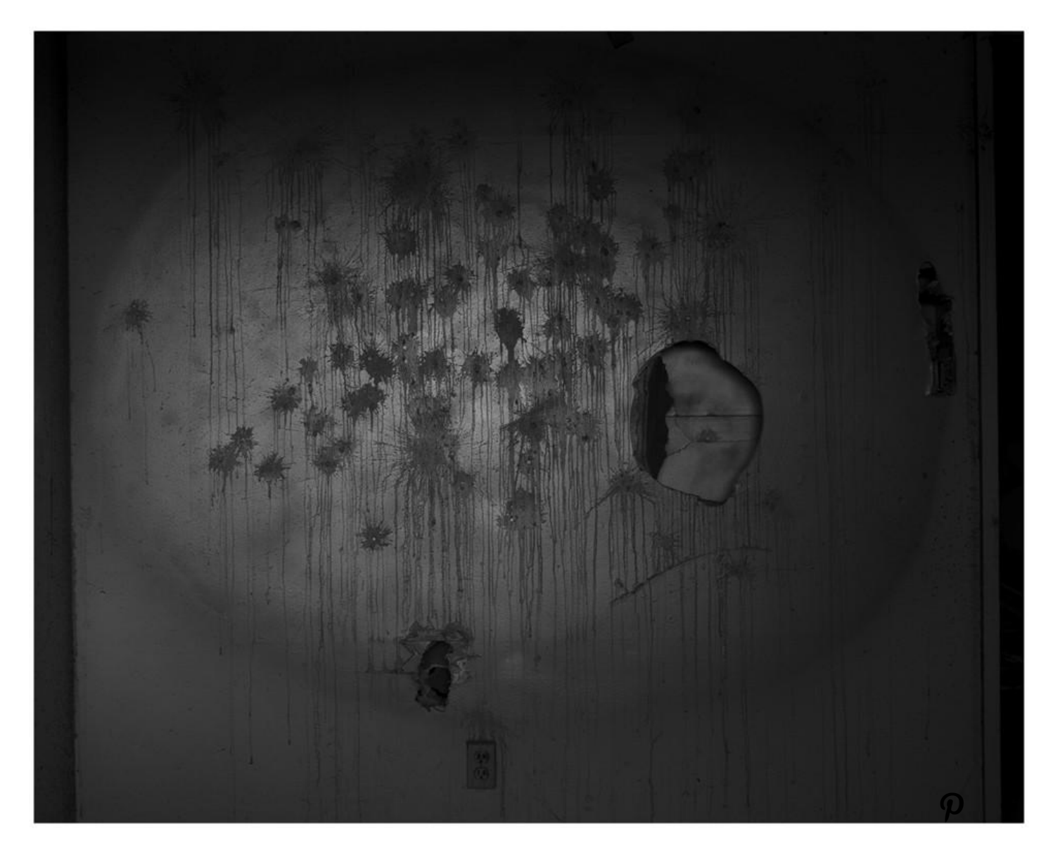
Work in Progress George Air Base, Untitled, 2016