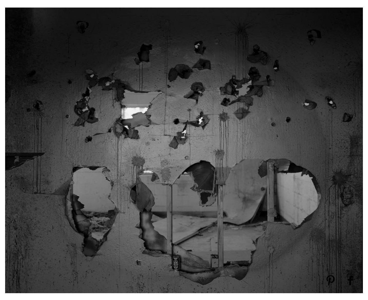
Work in Progress George Air Base, Untitled, 2016