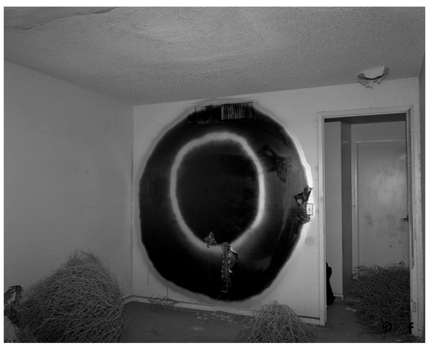
Work in Progress George Air Base, Untitled, 2015