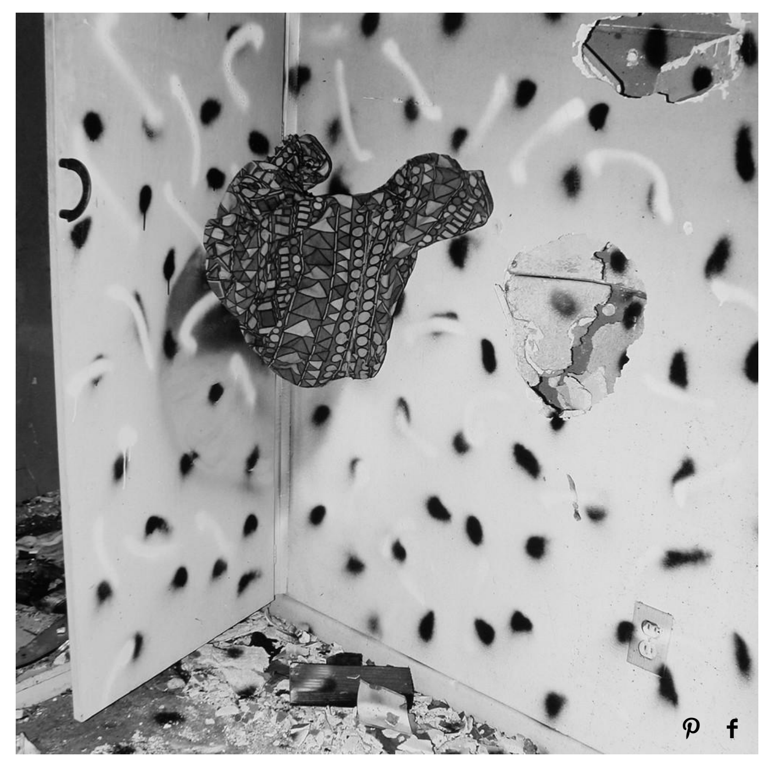
Form Vandalism Series, 74V02, 1974