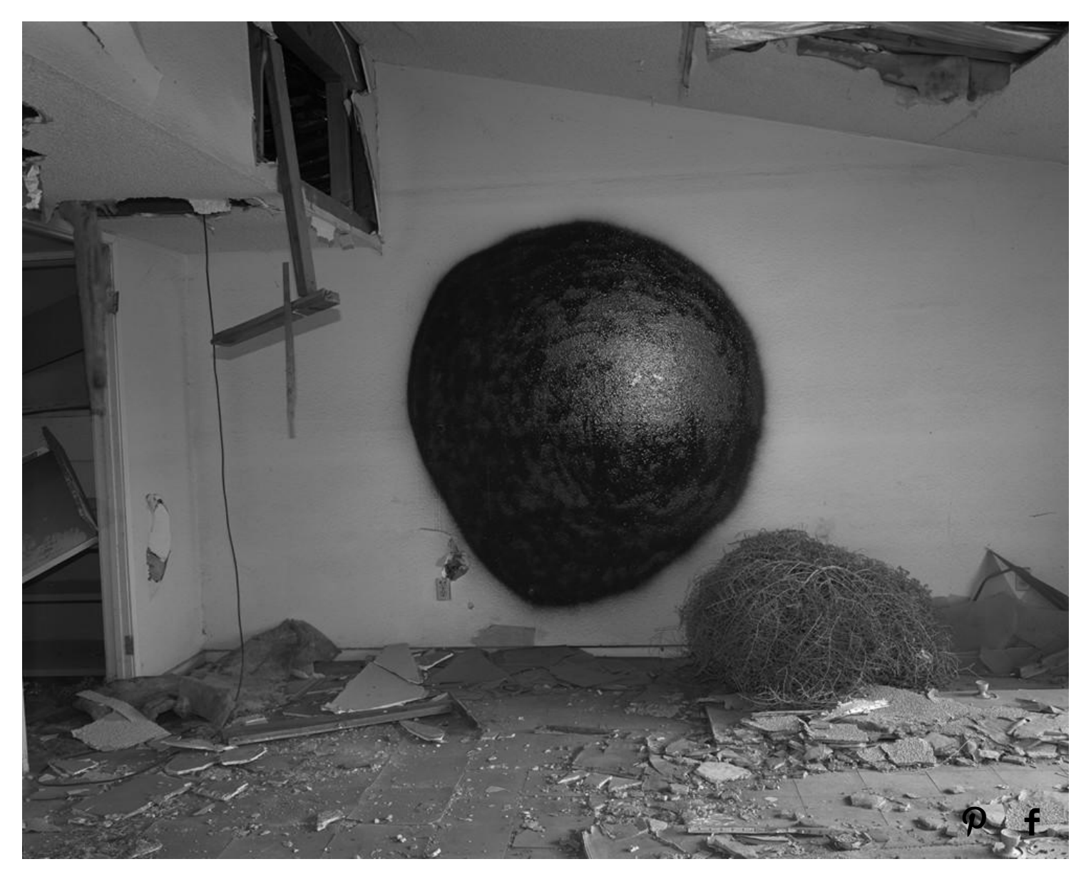
Work in Progress George Air Base, Untitled, 2015