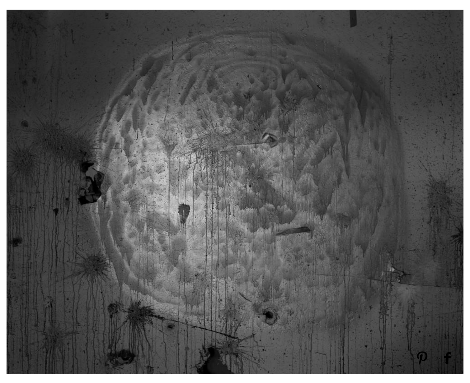
Work in Progress George Air Base, Untitled, 2016