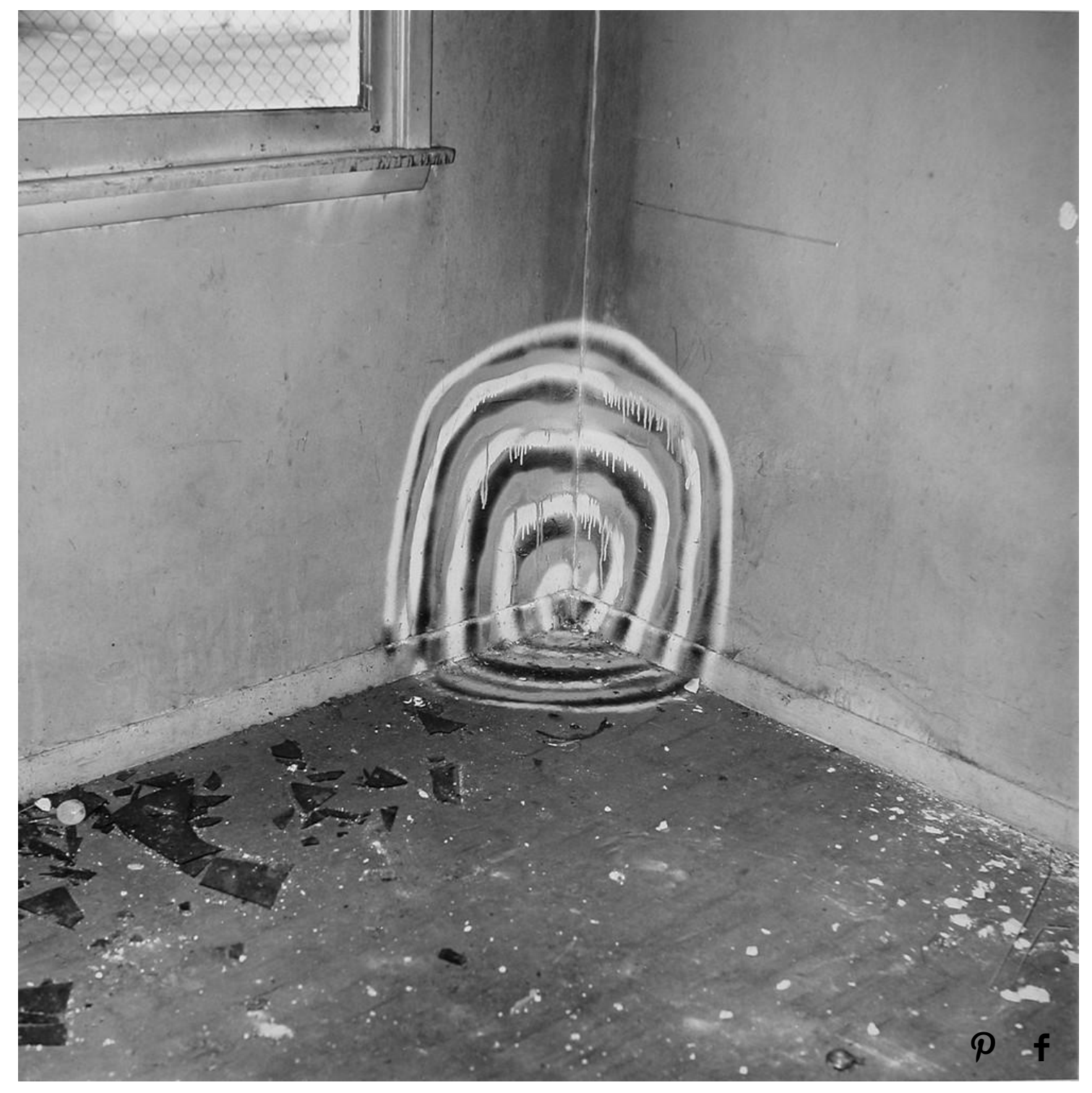
From Vandalism, 74V17, 1974

The black-and-white photographs in his Vandalism series, which he made in those abandoned homes, still feel transgressive today; they also work as pure imagery. Circles emanate out concentrically, dots resolve into patterns, or pyramids. Some of the pictures almost seem to vibrate, like optical illusions. They speak to the history of painting, to street art, to photography. But despite the title of the series, looking back Divola doesn't see a link between what he did and traditional graffiti.