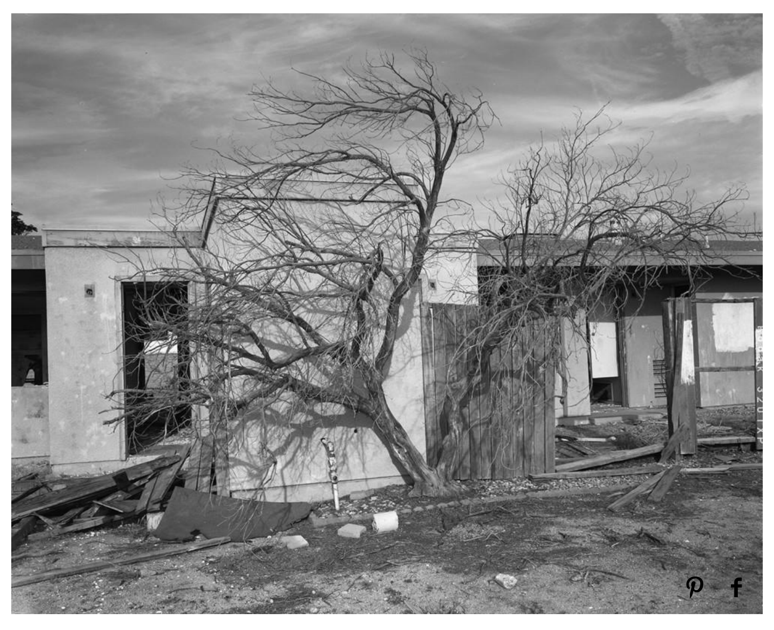
Work in Progress George Air Base, Untitled, 2015