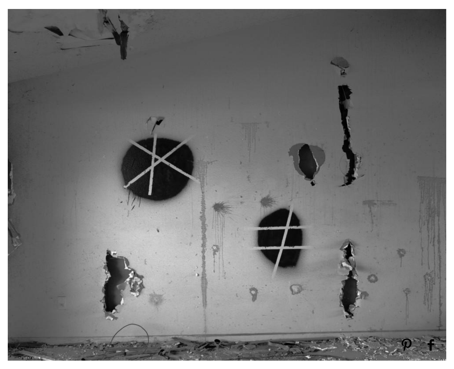
Work in Progress George Air Base, Untitled, 2015