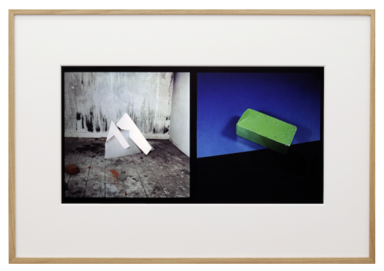
All following untitled photographs from . All following photographs courtesy the artist and Galeria Pedro Alfacinha.