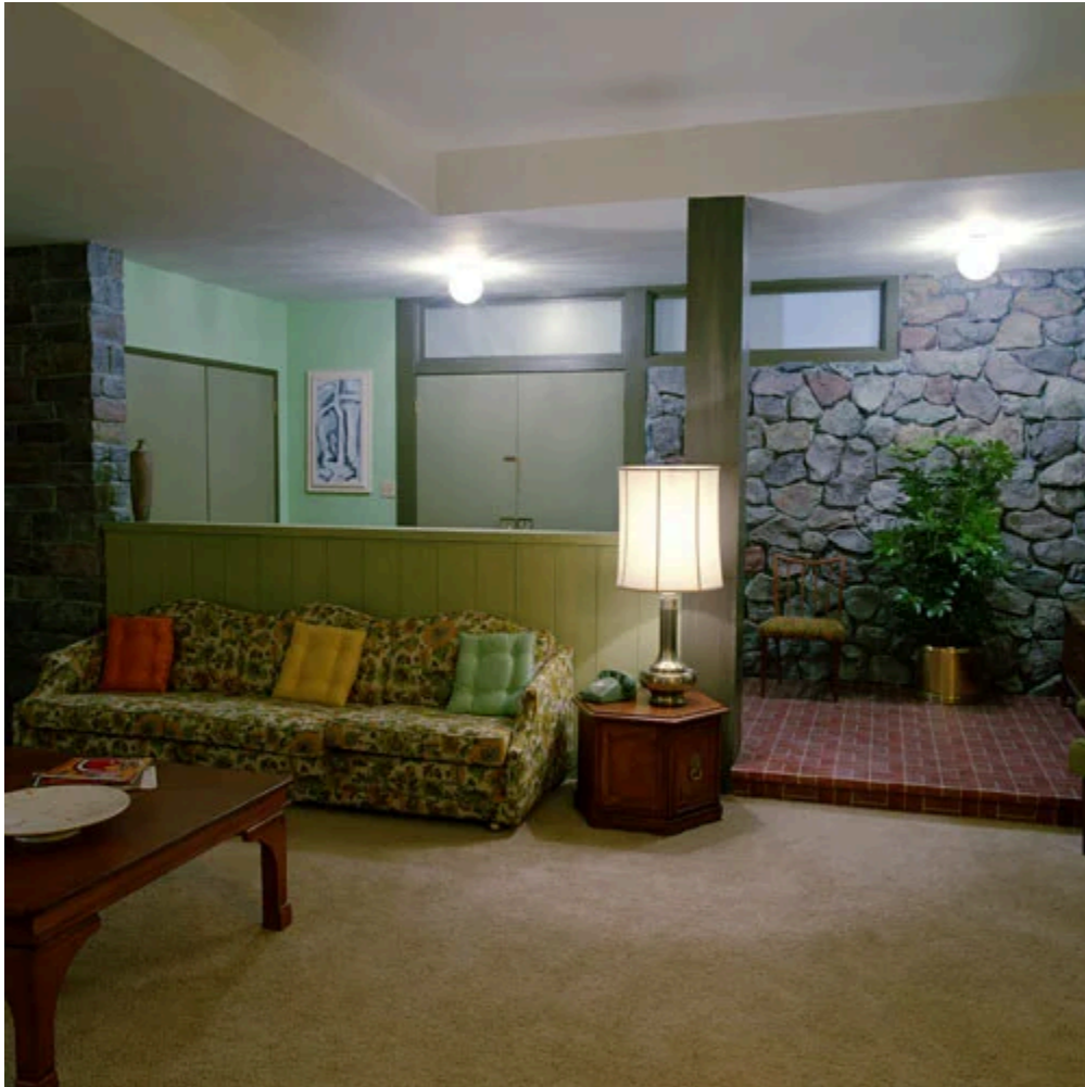
(X18F5) Brady Bunch House - Stage 6