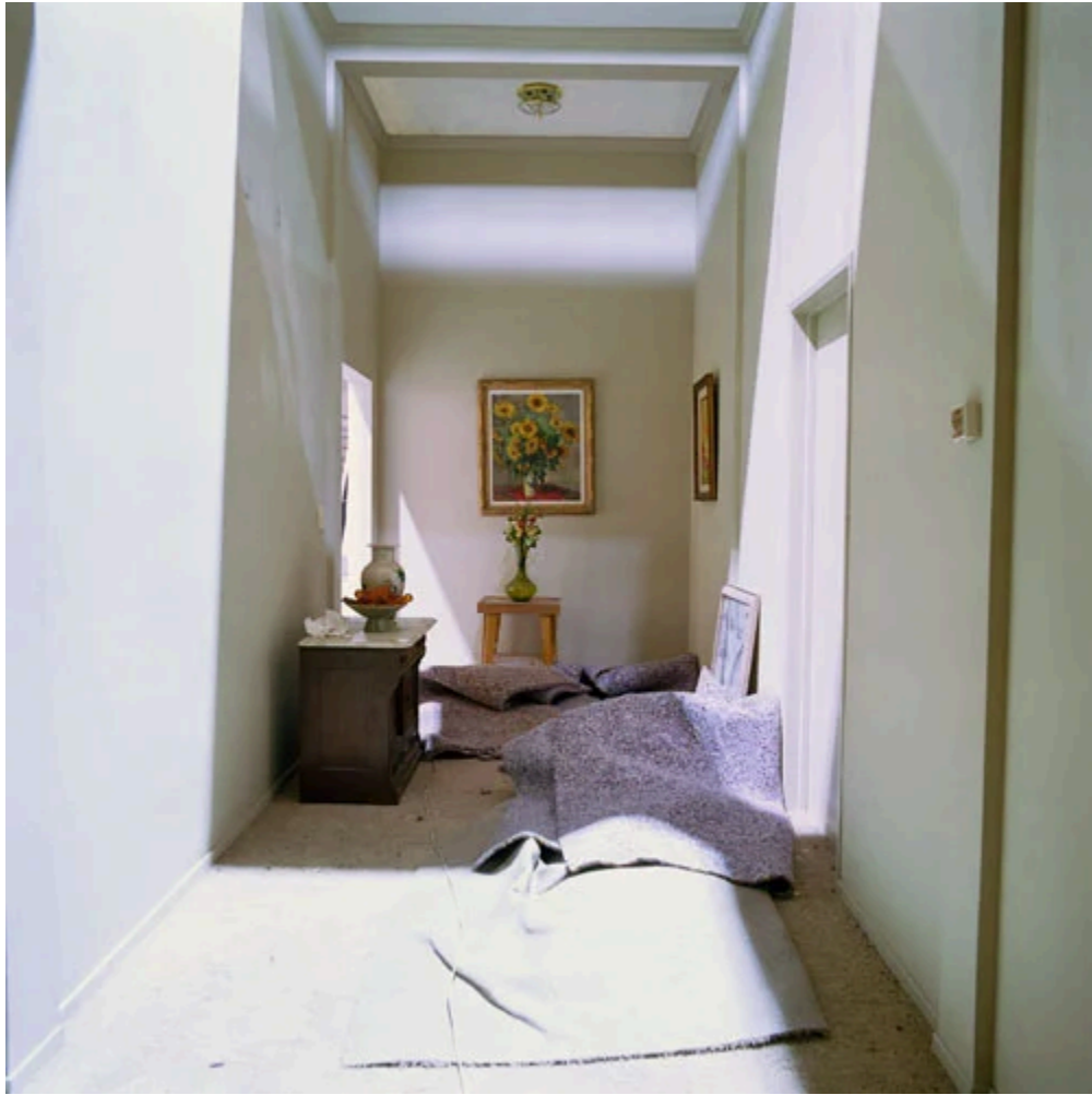
(X20F3) Brady Bunch House, Second Floor Hall - Stage 11