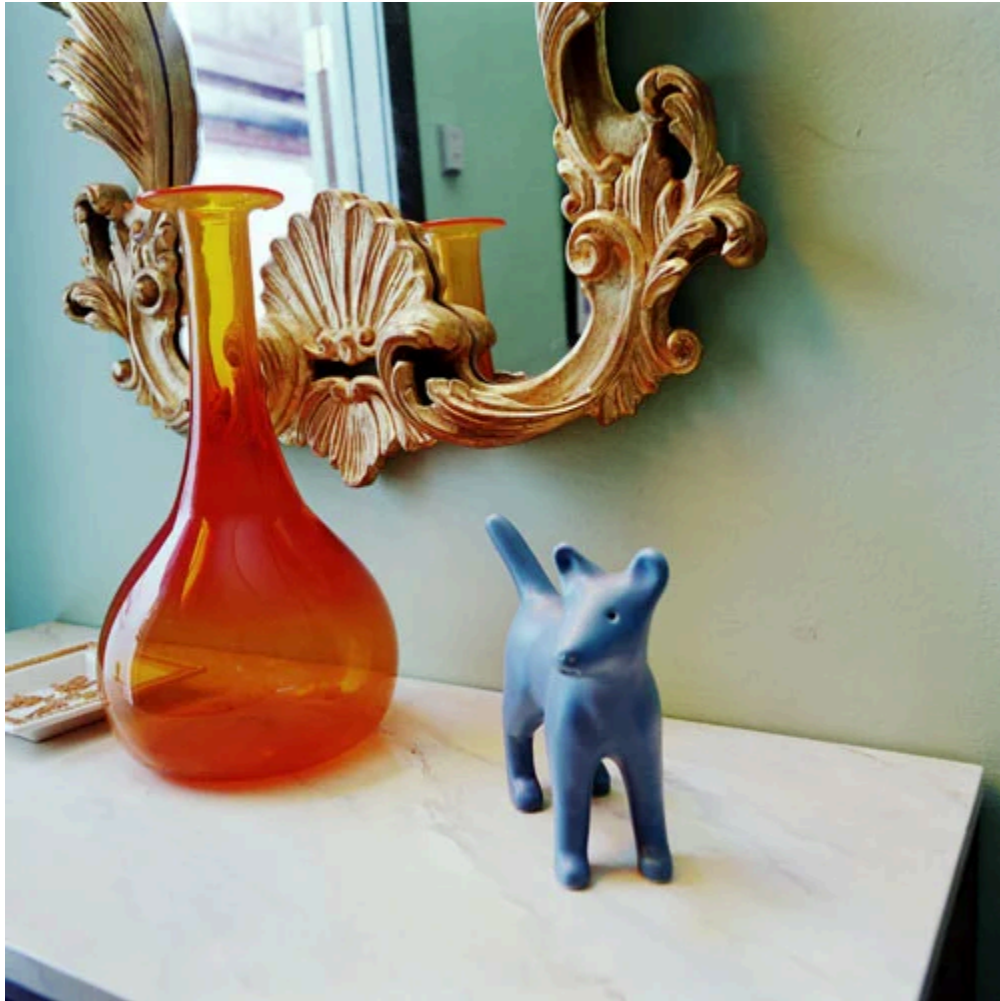
(X21F1) Brady Bunch House, Upper Landing, Detail - Stage 6