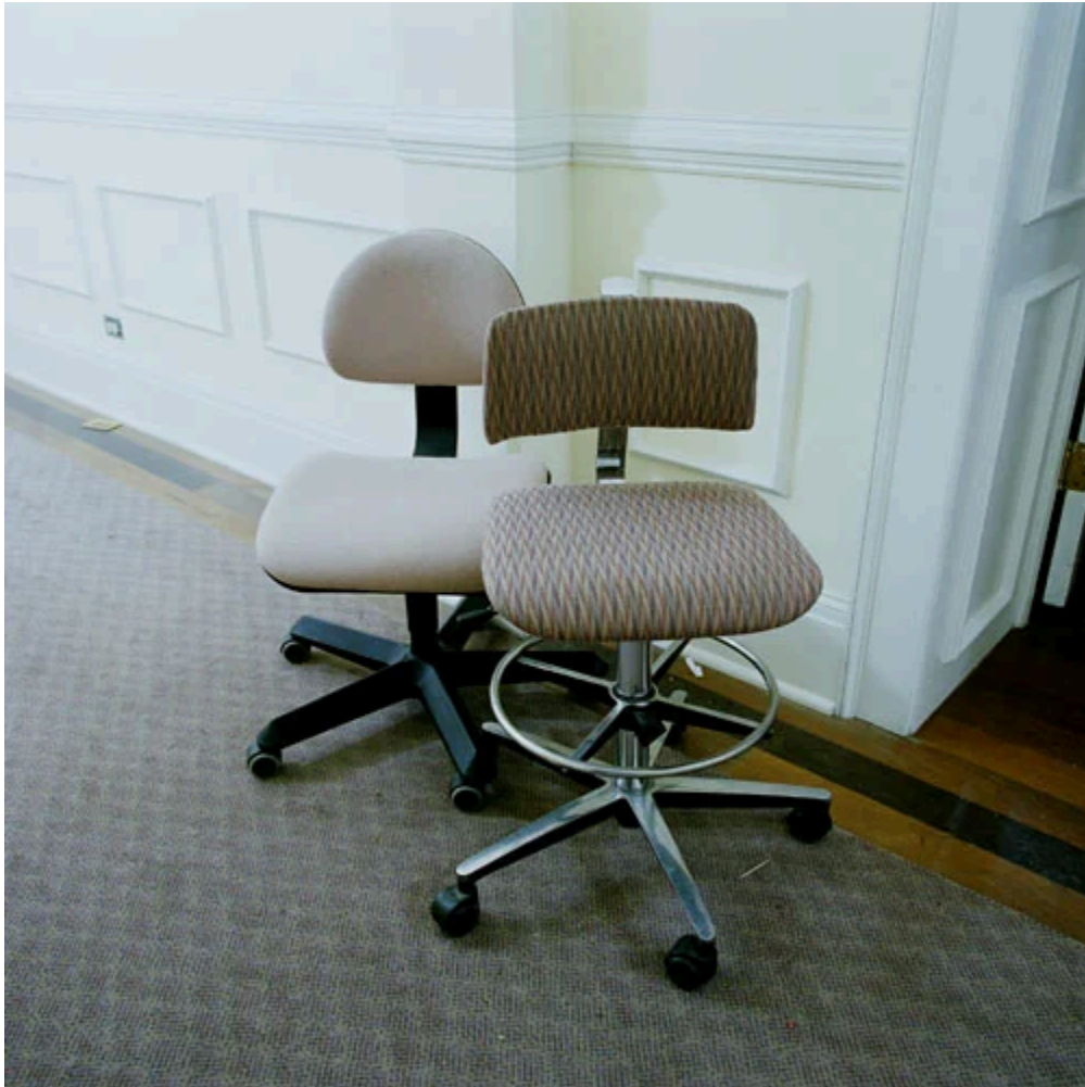
(X4F8) Hallway to Scully's Apartment, Chairs - Stage 5