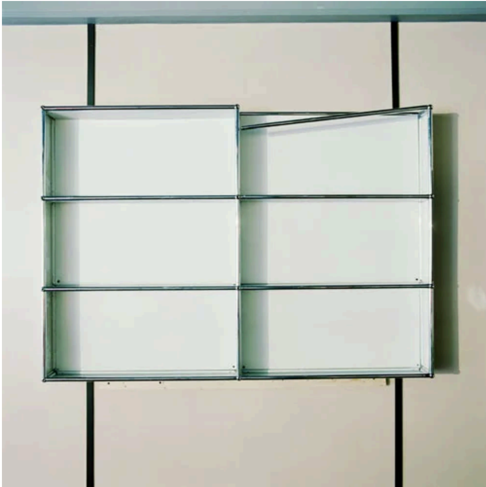
(X11 F6) Self Unit, Doppel Hospital - Stage 5