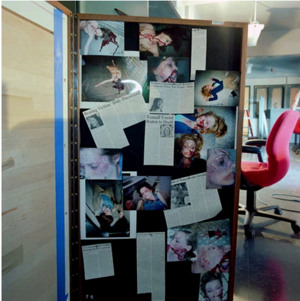
(X11 F12) Display Wall, Dallas Interview Room - Stage 6