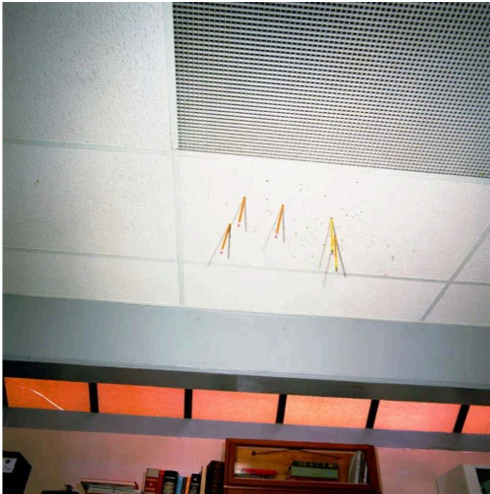
(X26F15) Ceiling Above Mulder's Desk - Stage 5