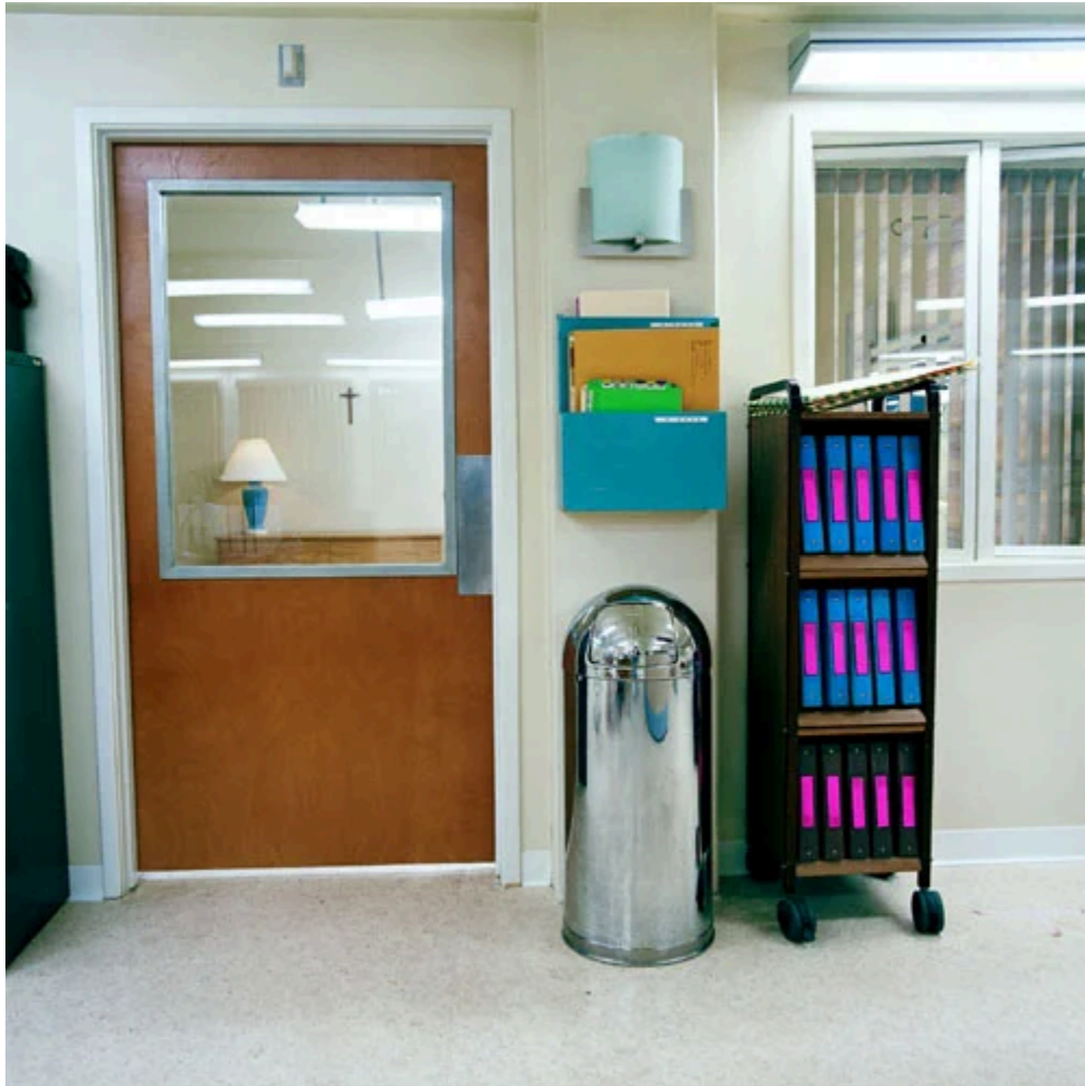
(X14F2) St. John of the Cross Hospital - Stage 5