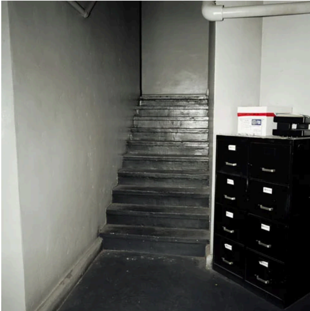
(X11F1) Hall to X-File Office - Stage 5