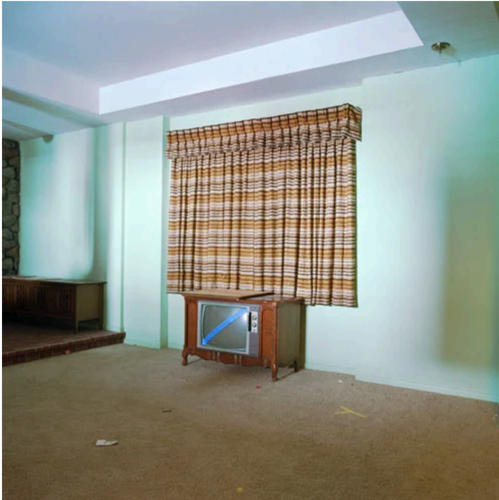
(X21F1) Brady Bunch House, Upper Landing, Detail - Stage 6