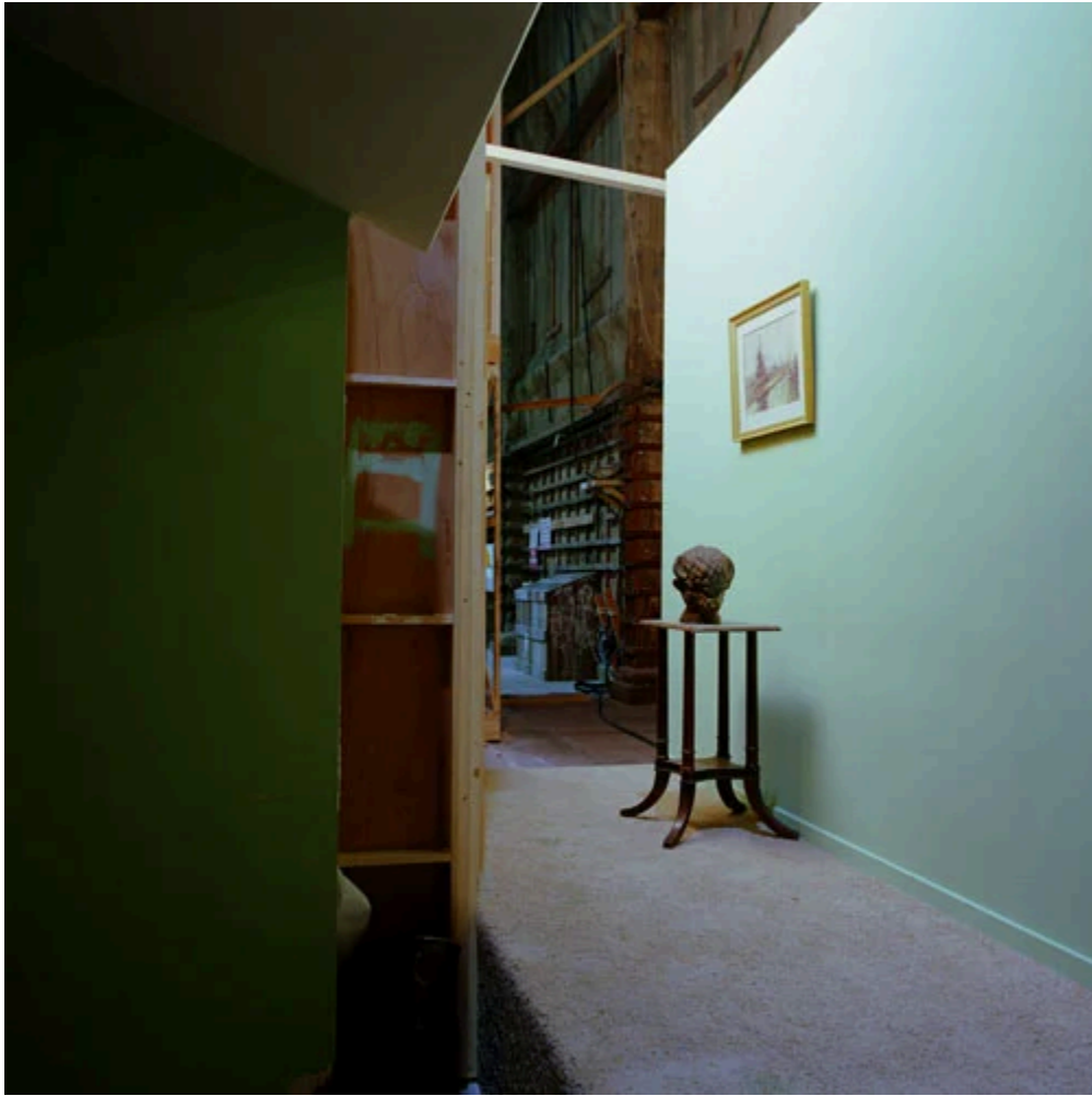
(X7F7) - Brady Bunch House, Upper Landing Hall Detail - Stage 6