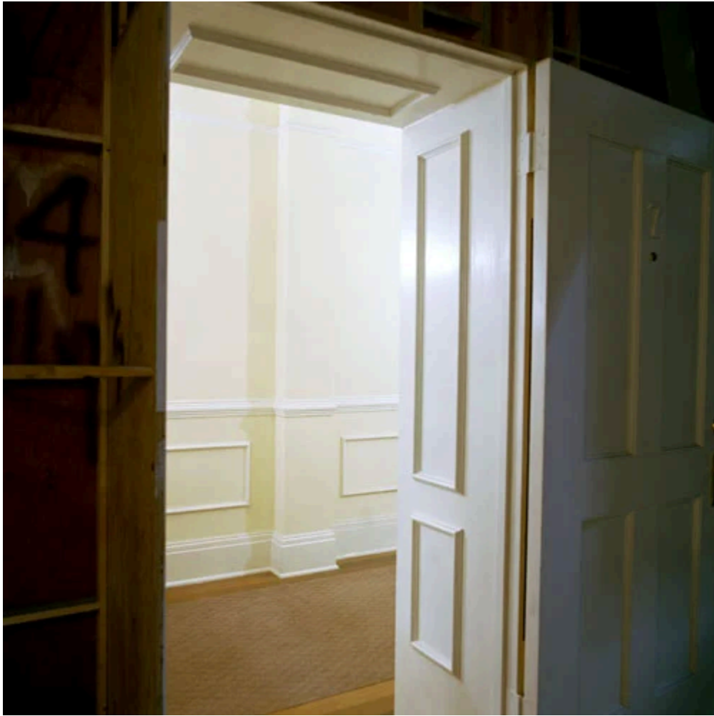
(X4F10) Hallway to Scully's Apartment, Georgetown - Stage 5