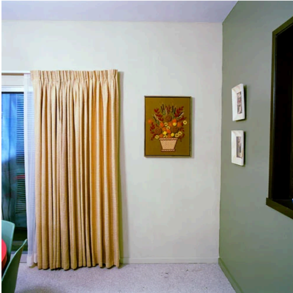
(X18F8) Detail, Brady Bunch House Dining - Stage 6