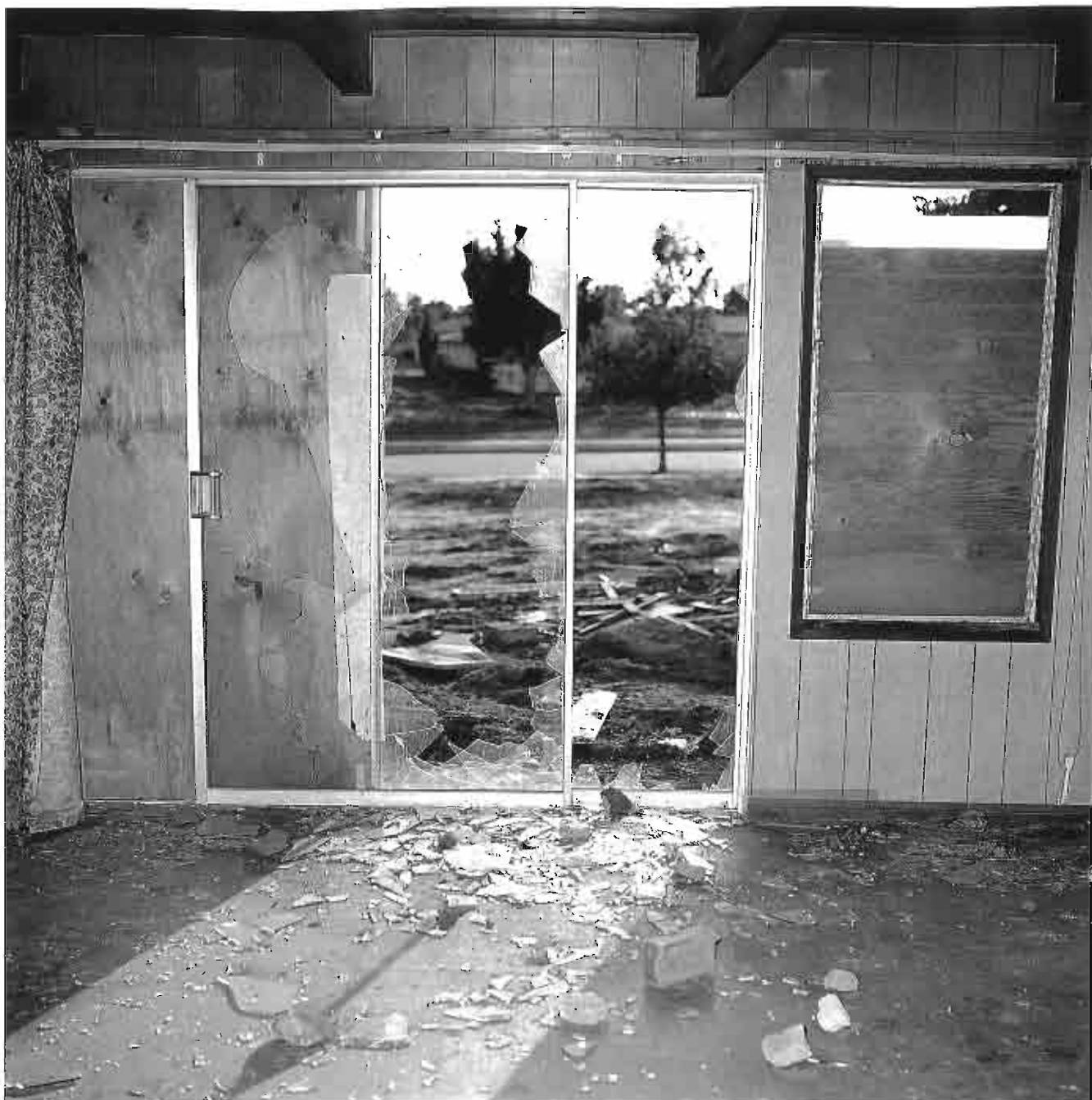
Forced Entry Site 29, Interior View A, from the "LAX/ Noise Abatement Zone" series, 1975/1982, gelatin silver print, 14 inches square.