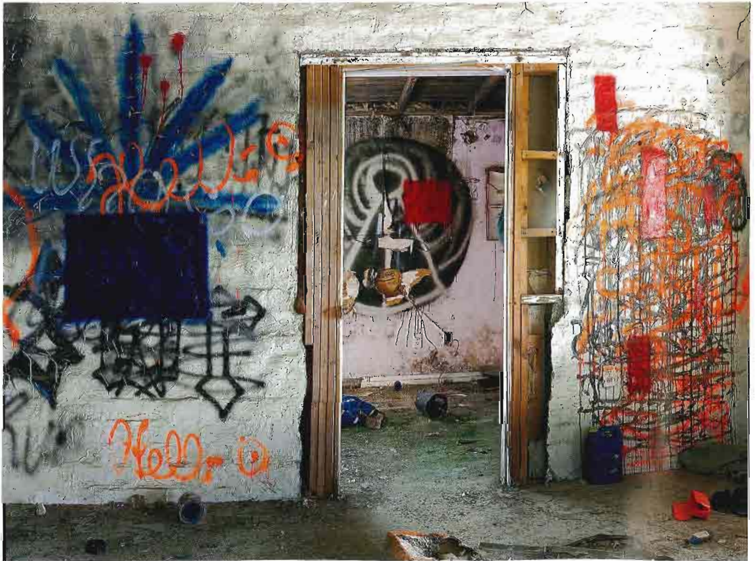
Theodore Street, 33.94522,- 117.138789, 1/27/2012, 3:31PM-3:45PM, 2013, pigment print, 40 by 54 inches.