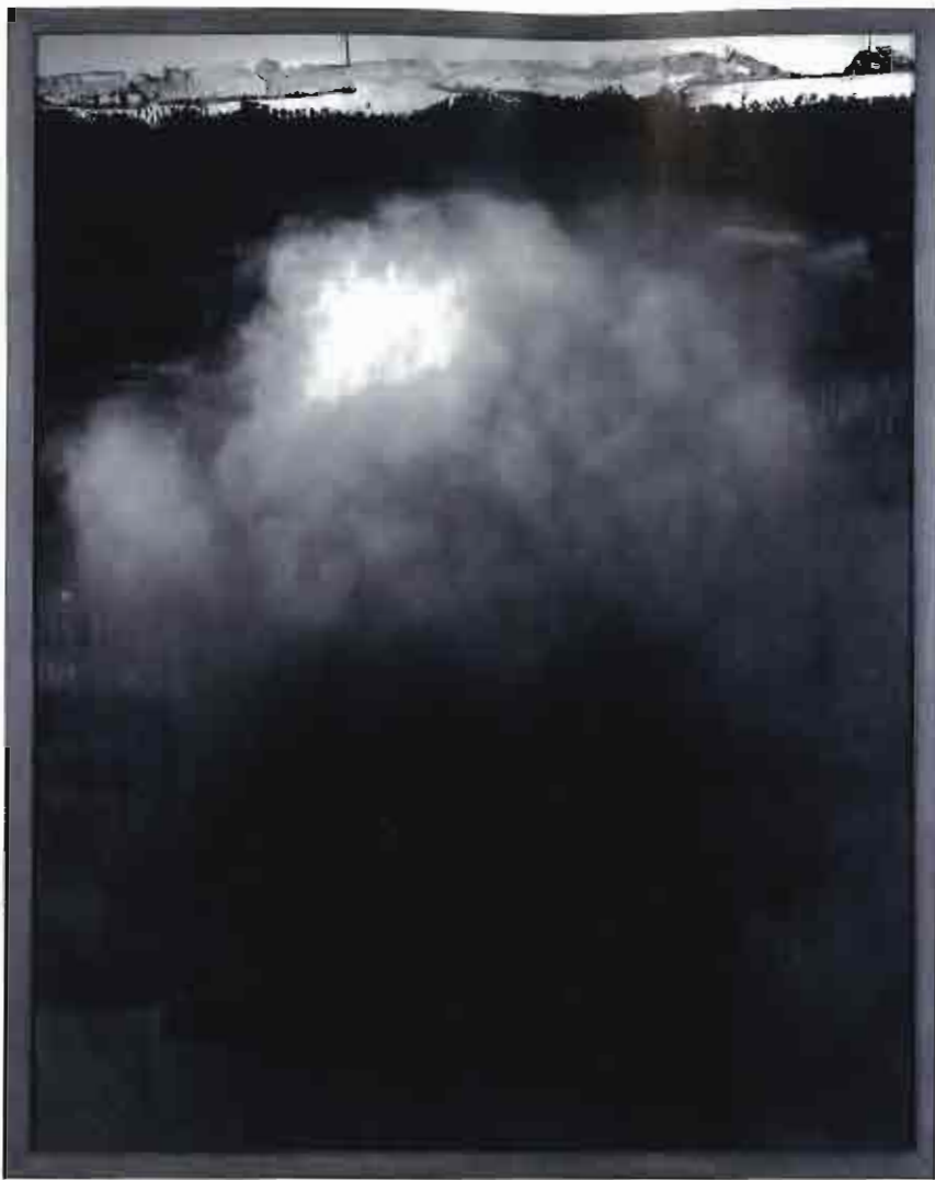
Untitled F , 1990, gelatin silver print, 60 by 48 inches.