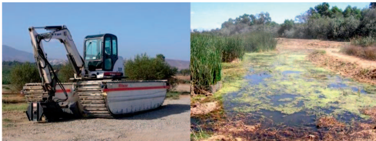
Figure 1. —The brush cutter (left panel) used reduce emergent vegetation surrounding experimental exclosures and the wetland showing inundated cut vegetation (right panel). This practice should be discouraged because it greatly enhances mosquito production.

processes such as succession is by no means certain and repeatable even in adjacent replicate wetlands. Meeting the conservation needs of diverse fauna and flora can be problematic. For example, man-made riverine wetlands can serve the needs of riparian and wetland birds (Zembel et al. 2003) and mammals, but are habitat sinks for native fishes and amphibians because of predation and competition from non-native fauna that proliferates in lentic conditions (Why et al. 2014).