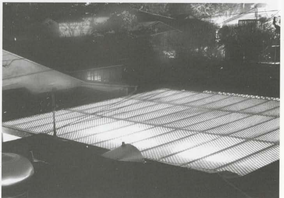
Amir Zaki, 333-2 , 2001, laser direct type-C print, ed. of eight, 22½" x 29½" (framed).