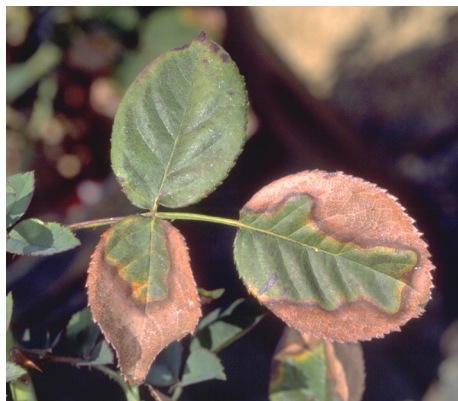
Rose leaves turning brown from drought stress.

labels. She noted that comparing risks between types of pesticides and understanding their impact on people and the environment helps retail staff communicate options to the public so they can make a more informed choice on what products or tools to use.