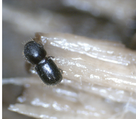
Adult female polyphagous shothole borer, Euwallacea sp.