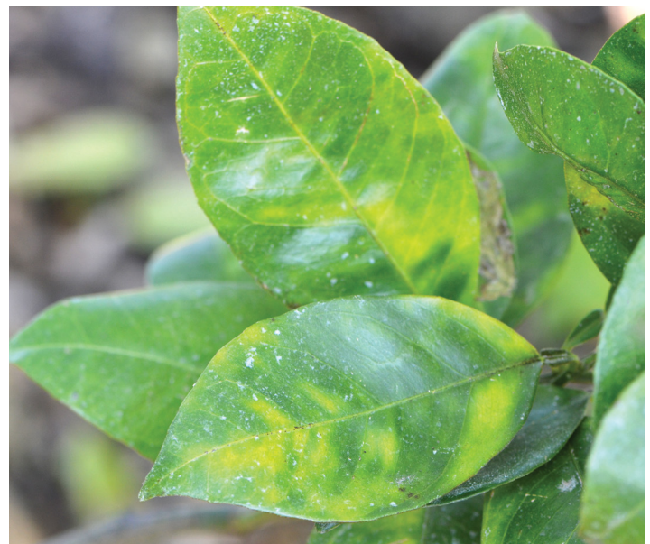
Huanglongbing (HLB) leaf symptoms.