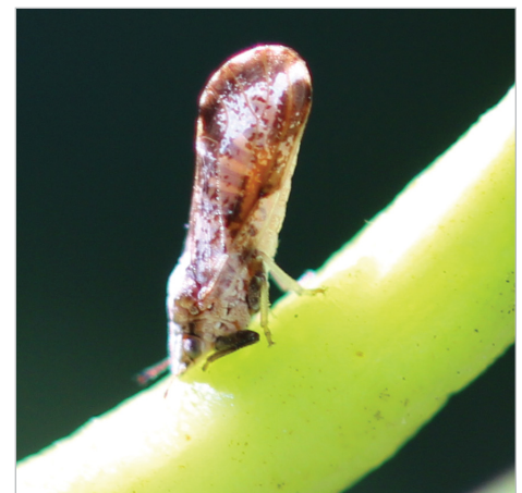
Highly magnified adult Asian citrus psyllid feeding on citrus.